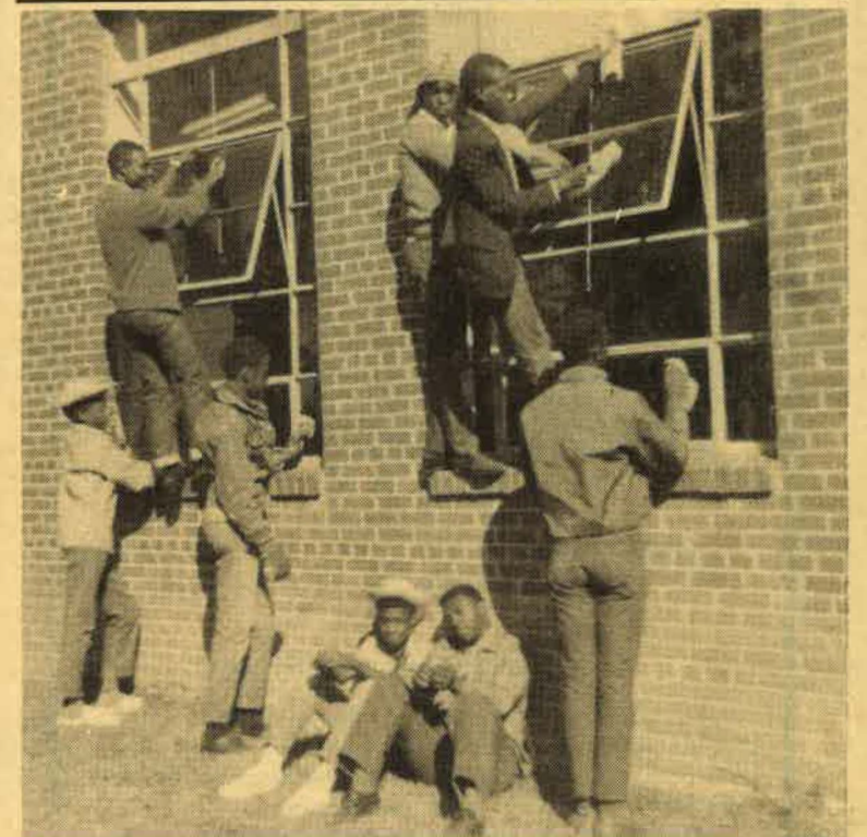
FFA'ers "working out" during recent initiation.

An editor is a writer who uses other people's stories and gets blamed when the names are misspelled.