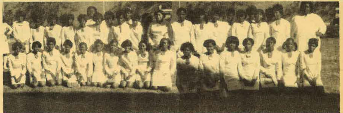
Freshmen FHA'ers "line up" after initiation.

Your best opportunity is today. Tomorrow is the other fellow's.