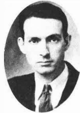
G. E. Medus Industrial Arts