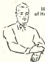
Illegal use of Hands or Arms