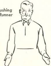
Crawling, Pushing or Helping Runner