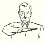
Illegal Motion or Formation at Snap