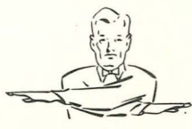
Penalty Refused, Incomplete Pass, Missed Goal, etc.