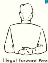
Illegal Forward Pass