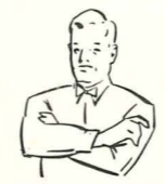
Delay of Game or Excess Time Out