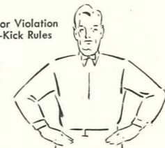
Off-side or Violation of Free-Kick Rules